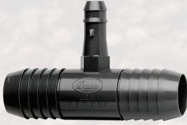
SW1401-099 & SW1401-129